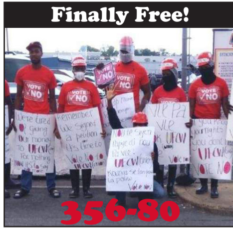
Employees at Mountaire Farms in Delaware fought “contract bar” delays from tyrannical UFCW union officials for almost two years. Finally, they’ve overwhelmingly voted out the union.

Initially, an NLRB regional official rejected union arguments