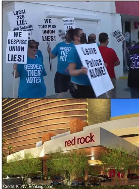
NLRB officials stacked the deck against rank-and-file Red Rock Casino employees by imposing an unpopular union on them despite worker objections.