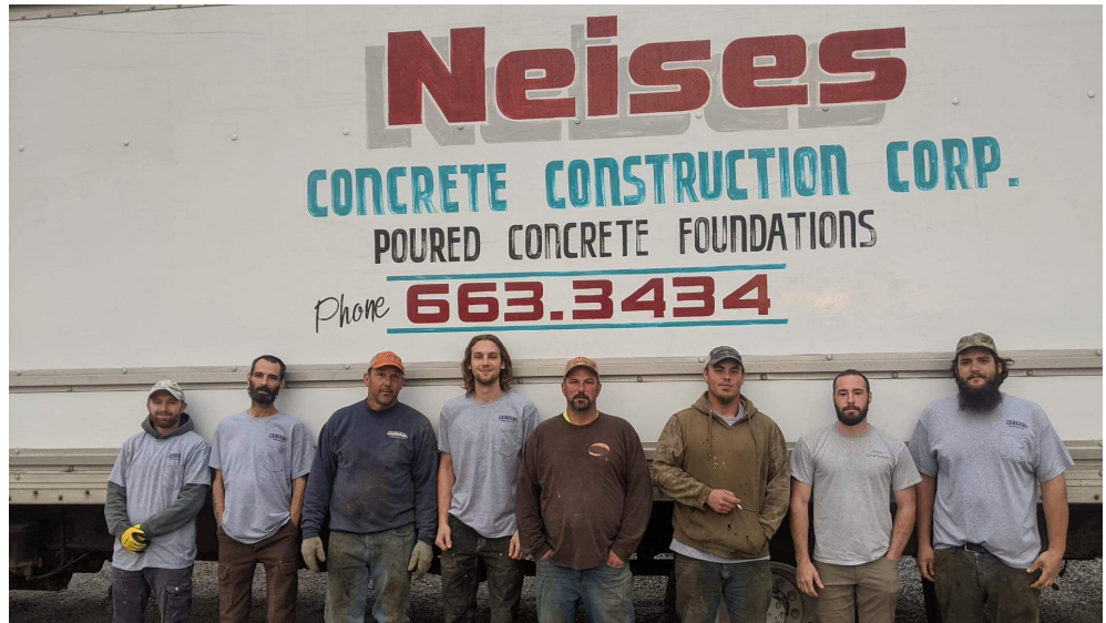
Foundation staff attorneys are defending Neises Concrete Construction Corp. workers’ unanimous call to free themselves from the coercive reign of IKORCC union bosses.

So far union officials have stymied the vote through “blocking charges,” unfair labor practice charges filed by union lawyers that, before they are resolved, prevent a vote from taking place. Union officials claim