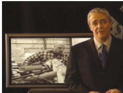
Teaching Learning Network

PBS's Scott Simon profiles the Foundation's mission and the Right to Work movement in the nationwide television documentary series titled Voices of Vision.