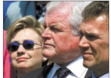
Union shills in the U.S. Senate (above) are exploiting the national crisis to ram through new power grabs.

Meanwhile, union bosses launched a wave of crippling strikes. As state officials scrambled to deal with health and security concerns, Minnesota union bosses ordered the largest government employee strike in that state's history. (Foundation attorneys were contacted