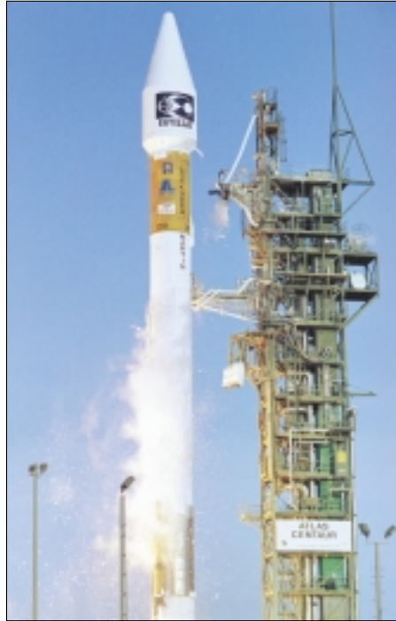
On "exclusive federal enclaves" such as Cape Canaveral, Florida, Right to Work laws do not apply.