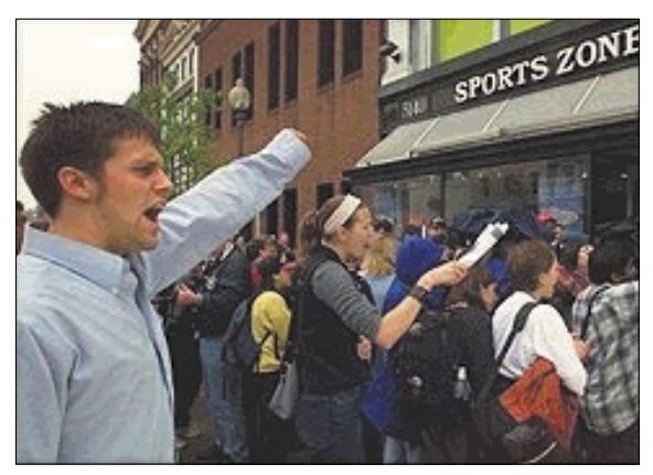
Union organizers are working to force graduate teaching assistants into union collectives, further solidifying union control over America's educational system.

Administrators illegally handed union officials confidential information