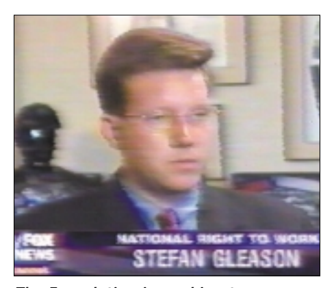
The Foundation is working to expose the shady self-dealing by the union bosses that run ULLICO.

In November 2000, ULLICO's board authorized a stock repurchase at the inflated price of $146 a share through an arrangement which permitted directors to sell back their entire personal holdings. The scheme did not permit larger stockholders, like union pension holders, to sell back more than a small portion of their ULLICO stock. By allowing themselves to liquidate their entire personal holdings at an inflated price, ULLICO's board of