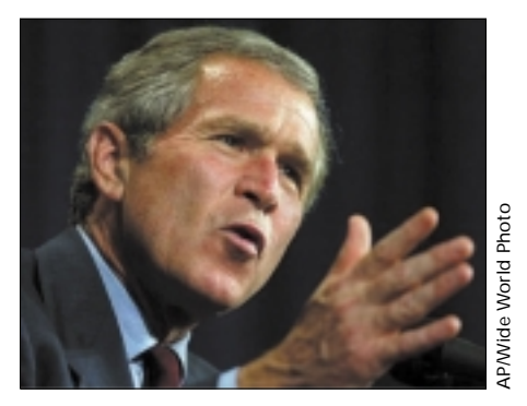
After taking a small step to prohibit union-only federal construction projects, the Bush Administration enjoyed legal assistance from Foundation attorneys.

PLAs effectively exclude the vast majority of contractors and employees from government-funded construction projects, as more than 80 percent of American contractors and their employ-