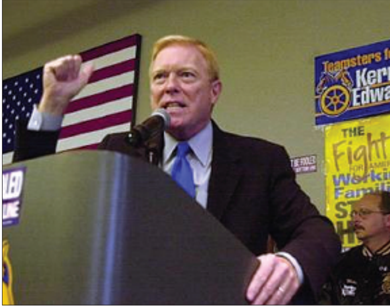
Anheuser Busch employees refused to subsidize Teamsters union partisans like former Rep. Dick Gephardt (D-MO).

Union officials thumb noses at NLRB, threaten retaliation for refusal to pay unlawful dues