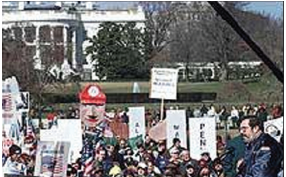
Steel workers union chief Leo Gerard (right) led a protest against the Bush administration while driving good jobs overseas with his forced unionism power grabs.

A central part of the deal is that employ-