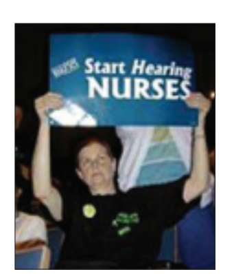
When union officials order health care workers onto the picket line, patients are abandoned.

ly claimed that employees at Camelot Lake could not revoke the union "duescheck off cards" until the narrow window period. The window period was unique to each employee and based on the date the cards went into effect.