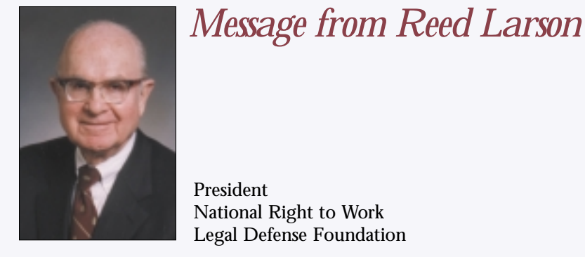
President National Right to Work Legal Defense Foundation

They'll begin receiving issues within weeks.