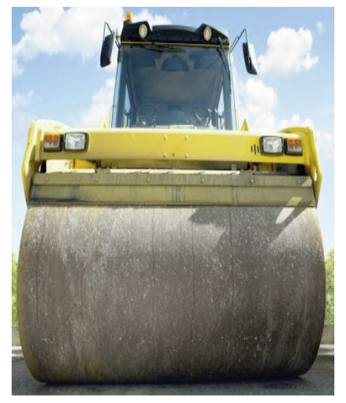
The owner of a construction company accused of violating a worker's rights in Colorado wants to steamroll Right to Work in Wisconsin.

Because Colorado does not have a Right to Work law, workers can be forced to pay union dues as a condition of employment. However, the United States Supreme Court held in the Foundation-won Communication Workers v. Beck decision that nonmember workers cannot be compelled to pay the portion of union dues used for the union's political and member-only activities. Union officials are also legally