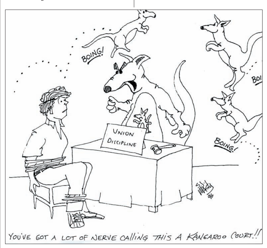
Union officials were planning to drag a Pennsylvania employee before their kangaroo court until Foundation attorneys intervened.