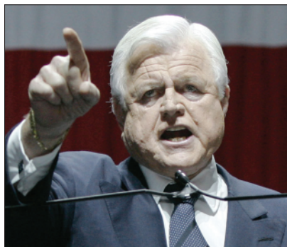
Senator Teddy Kennedy (D-MA) called the Foundation's victory for employee freedom achieved in the Dana/Metaldyne case "notorious."

With a few exceptions, employees seeking to protect themselves against