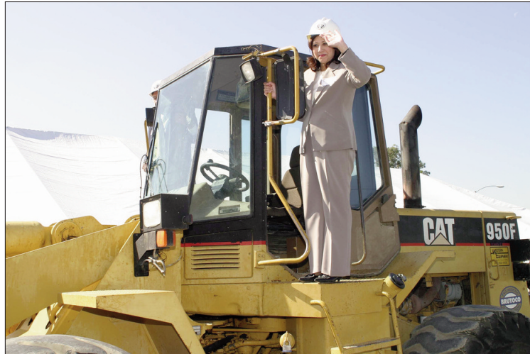
As Obama’s Secretary of Labor, Hilda Solis appears eager to bulldoze nonunion employ- ees, shoving them into forced-dues- paying union ranks.

On Friday afternoons in late January and early February – the time of the week during which Presidents try to sneak controversial stories by the national media – President Obama